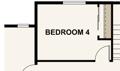
OPT. BEDROOM 4